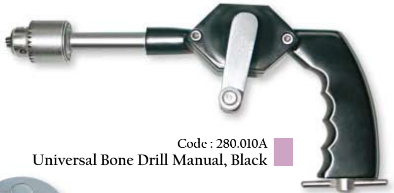
Code : 280.010A Universal Bone Drill Manual, Black