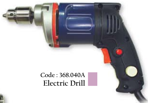
Code : 368.040A Electric Drill