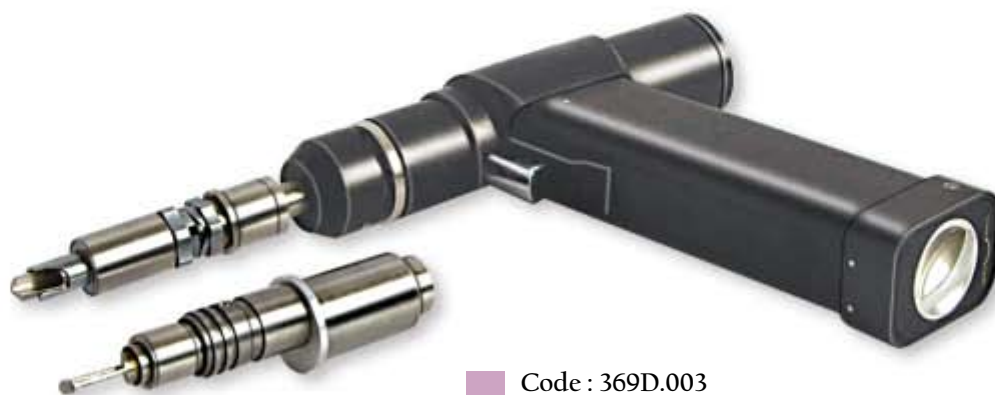
Code : 369D.003 Cranial Drill and Bur Battery operated