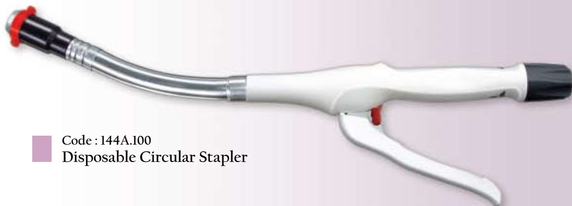
Code : 144A.100 Disposable Circular Stapler