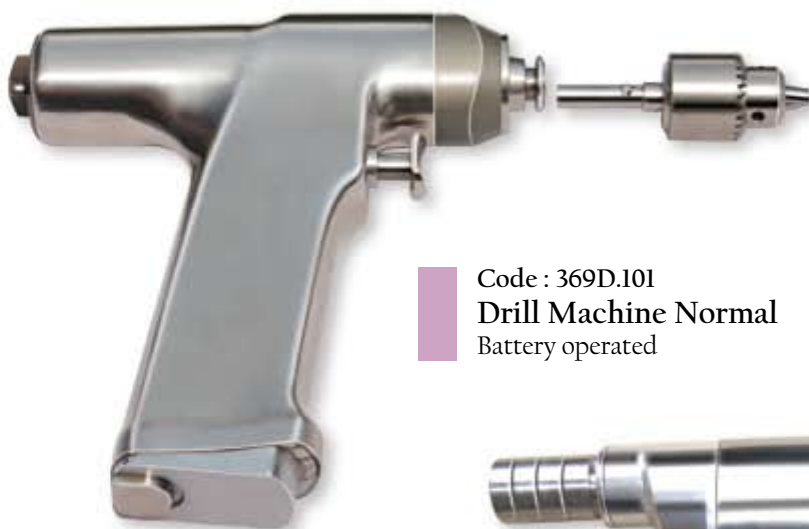
Code : 369D.101 Drill Machine Normal Battery operated

Battery powered - Mono function surgical drills and saw