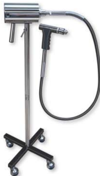
Code : 369.001 Driving unit includes Motor Stand, Foot control, Flexible shaft, tool kit, Oil Bottle & Special container (S.S. Bearing), Motor 1/8HP. Fully Covered with S.S. Body, High Torque • Hand piece provided separately