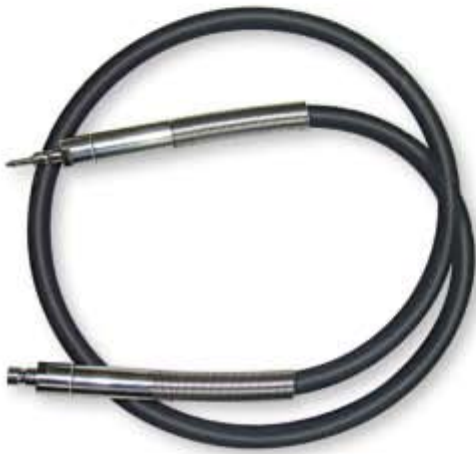
Code : 369.006 Flexible shaft for Driving unit