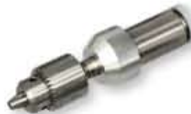
Code : 369D.202 Quick Chuck