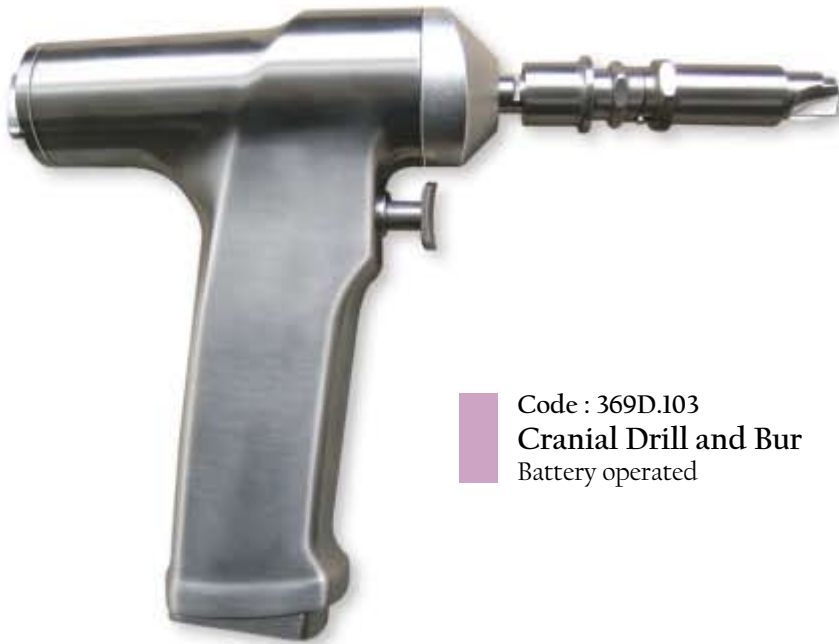
Code : 369D.103 Cranial Drill and Bur Battery operated