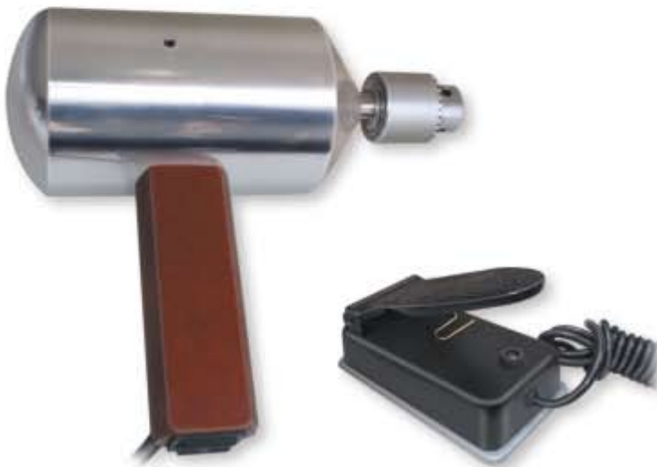
Code : 368.040 Electric Drill SS, with foot control