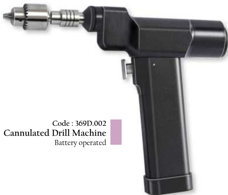
Code : 369D.002 Cannulated Drill Machine Battery operated