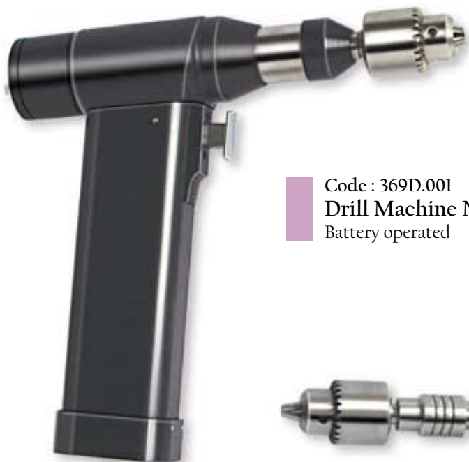
Code : 369D.001 Drill Machine Normal Battery operated

Battery powered - Mono function surgical drills and saw