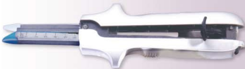
Code : 144A.200 Disposable Linear Cutter