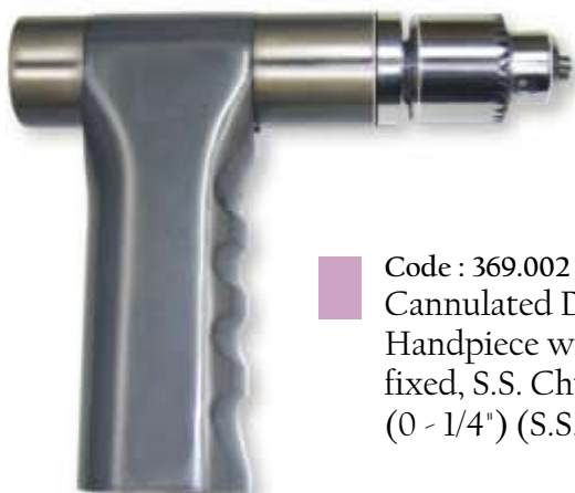
Code : 369.002 Cannulated Drilling Handpiece with fixed, S.S. Chuck (0 - 1/4") (S.S. Bearing)

-Electric Multifunction Surgical Drill and Saw system