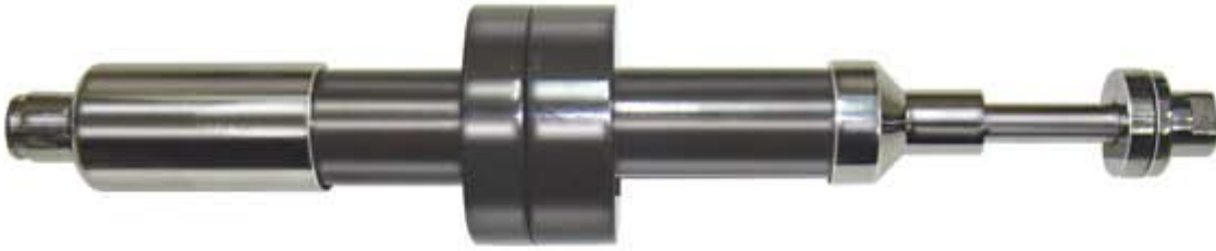
Code : 369.005 Oscillating Saw Handpiece (Set of five blades)