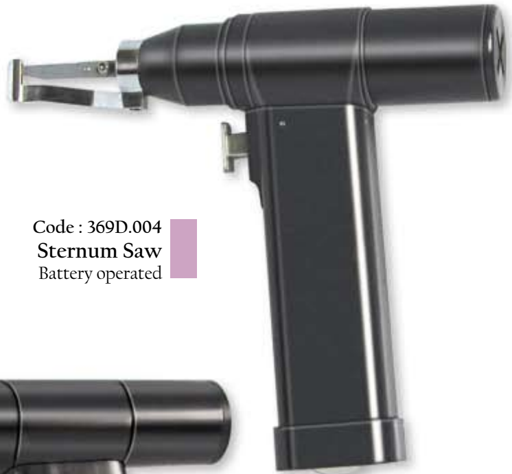
Code : 369D.004 Sternum Saw Battery operated