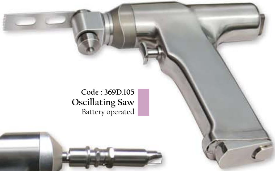
Code : 369D.105 Oscillating Saw Battery operated