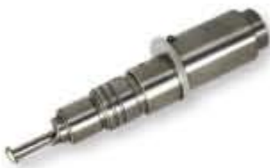
Code : 369D.206 Cranial Bur Attachment