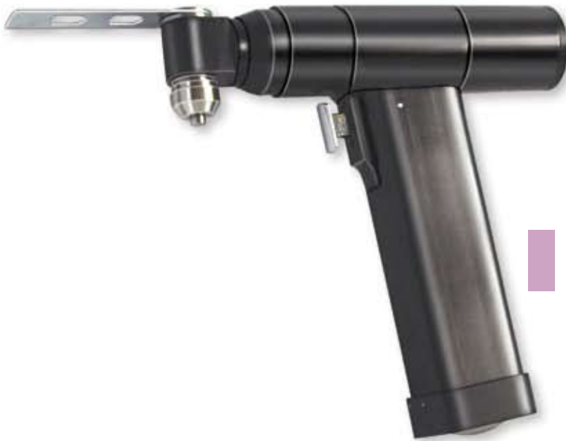
Code : 369D.005 Oscillating Saw Battery operated