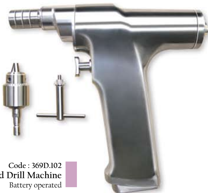
Code : 369D.102 Cannulated Drill Machine Battery operated