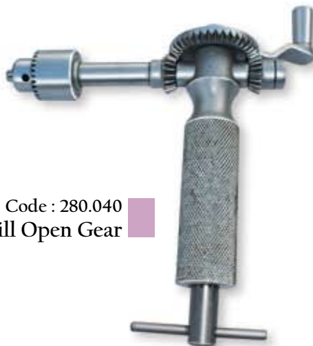
Code : 280.040 Micro Hand Drill Open Gear