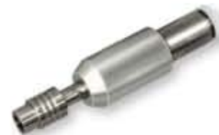
Code : 369D.205 Reamer attachment