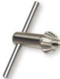
Code : 369.007 Drill Chuck Adaptor S.S.