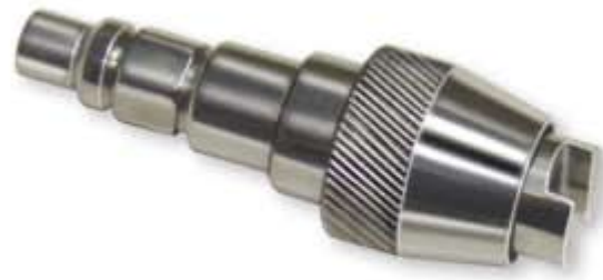
Code : 369.009 Hudson TYPE Adaptor S.S.