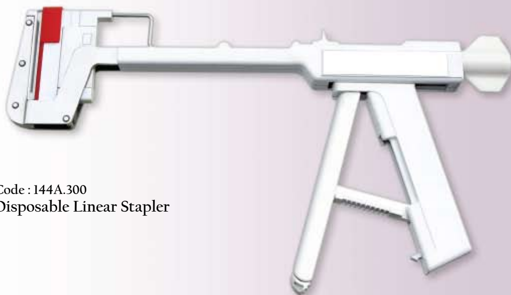
Code : 144A.300 Disposable Linear Stapler