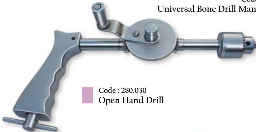
Code : 280.030 Open Hand Drill