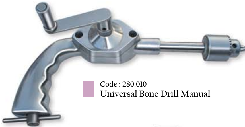
Code : 280.010 Universal Bone Drill Manual