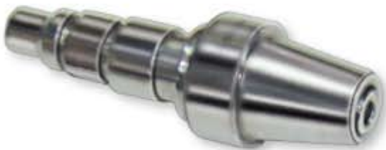
Code : 369.008 AO TYPE Adaptor S.S.