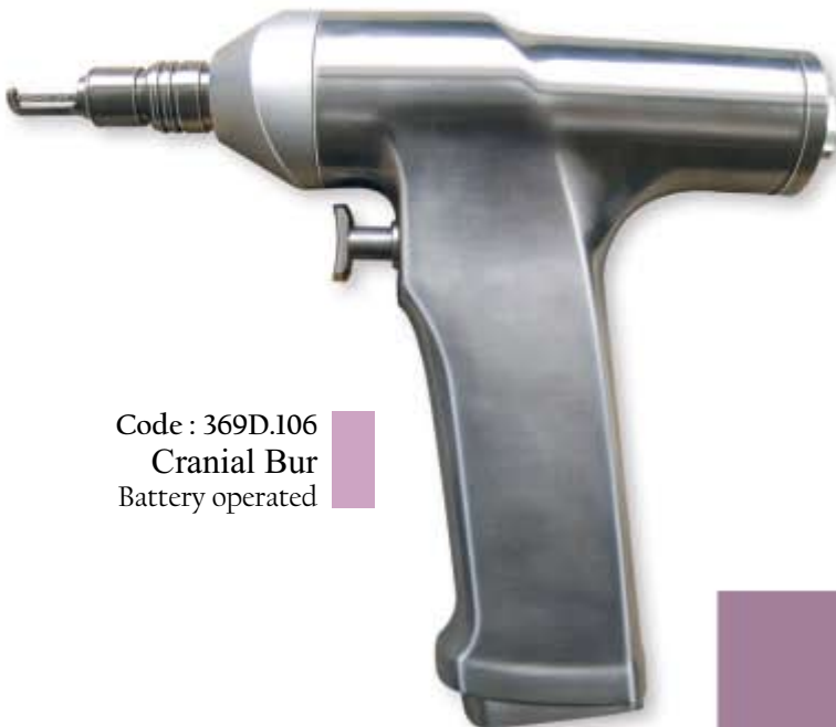
Code : 369D.106 Cranial Bur Battery operated