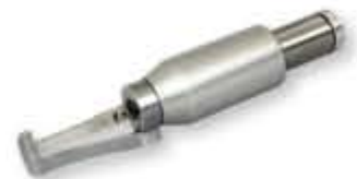
Code : 369D.204 Sternum Saw attachment