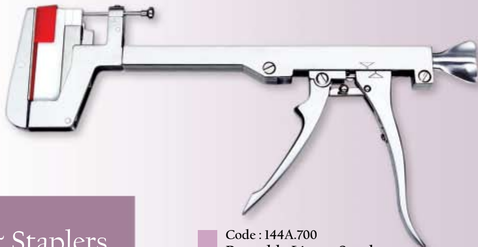
Code : 144A.700 Reusable Linear Stapler