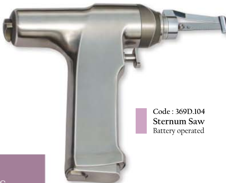
Code : 369D.104 Sternum Saw Battery operated