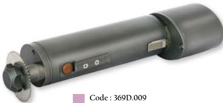
Code : 369D.009 Plaster Saw Battery operated