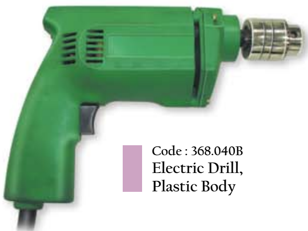
Code : 368.040B Electric Drill, Plastic Body