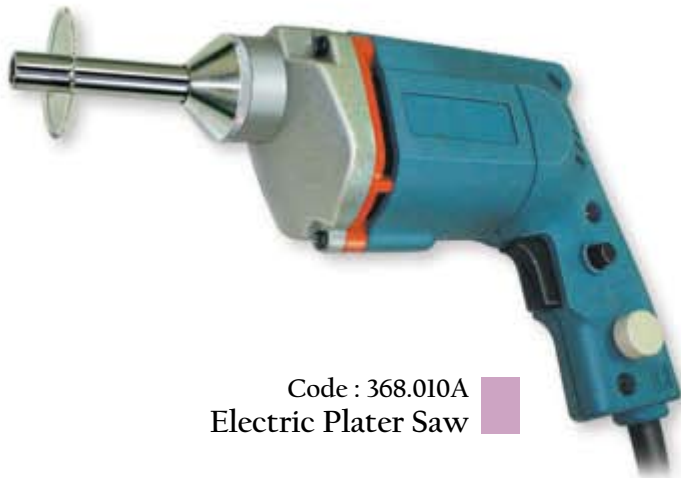
Code : 368.010A Electric Plater Saw