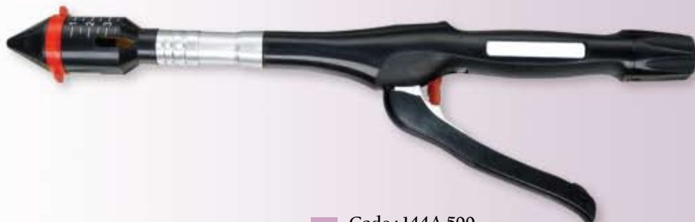
Code : 144A.500 Disposable PPH Stapler