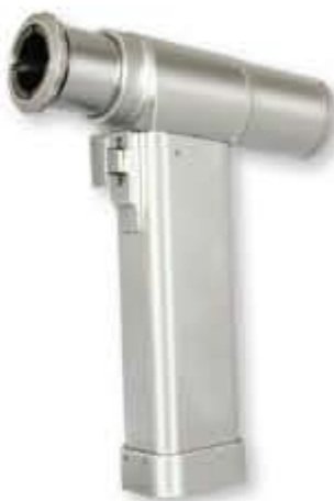
Code : 369D.201 Hand Piece Motor Battery Operated