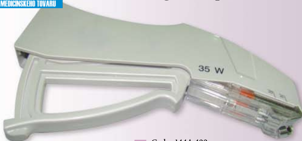
Code : 144A.400 Disposable Linear Stapler