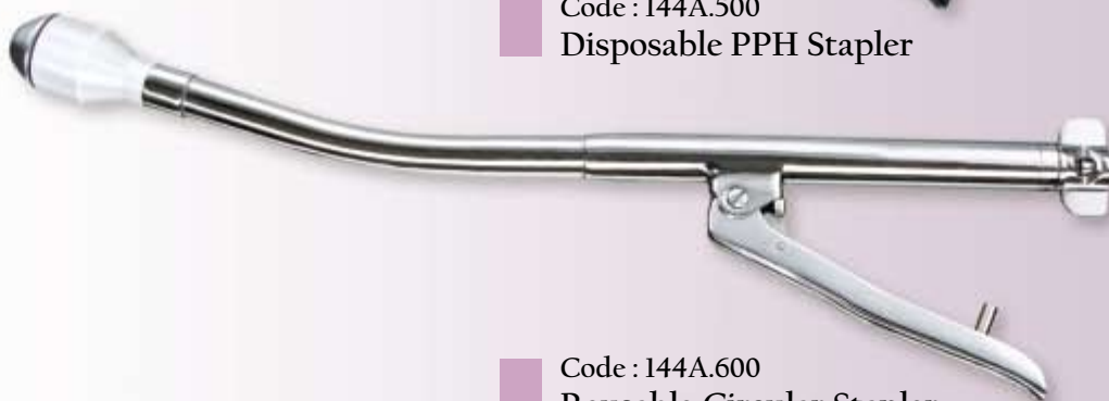
Code : 144A.600 Reusable Circular Stapler