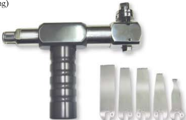
Code : 369.004 Saggital Saw Handpiece (Set of five blades) (S.S. Bearing)