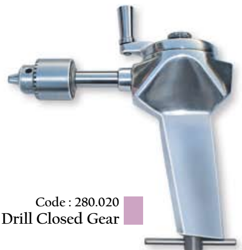
Code : 280.020 Micro Hand Drill Closed Gear