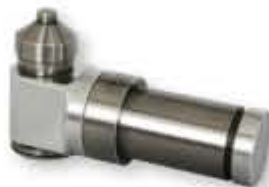
Code : 369D.203 Oscillating Saw attachment