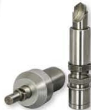
Code : 369D.208 Cranial Drill attachment